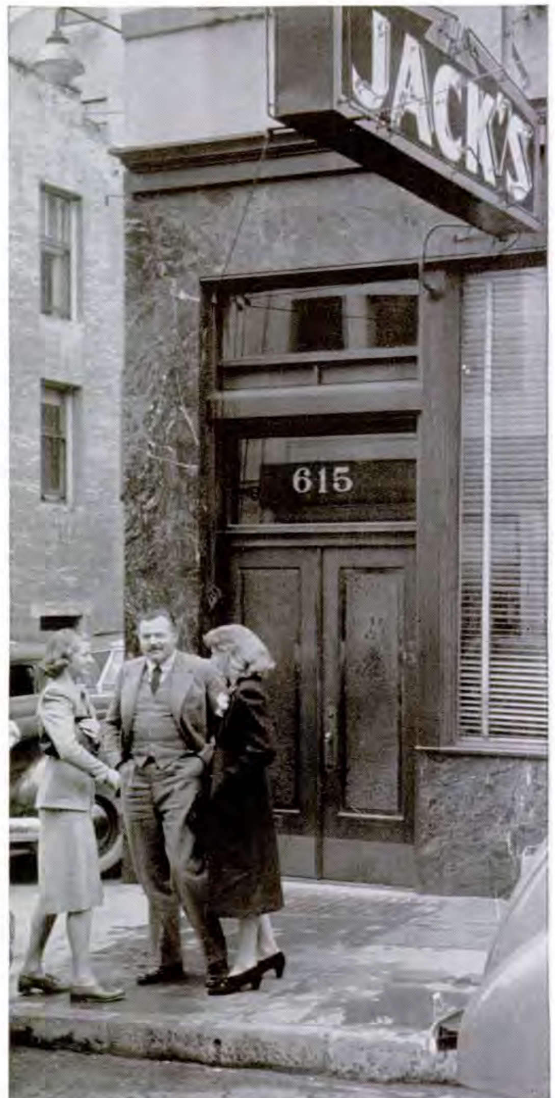
Author and actress meet on a corner in San Francisco. Ernest Hemingway, sailing for China with his wife Martha Gellhorn (right), is delighted with Ingrid Bergman (left).

Several days later For Whom The Bell Tolls was announced as the choice of 159 literary critics for 1940's outstanding book.