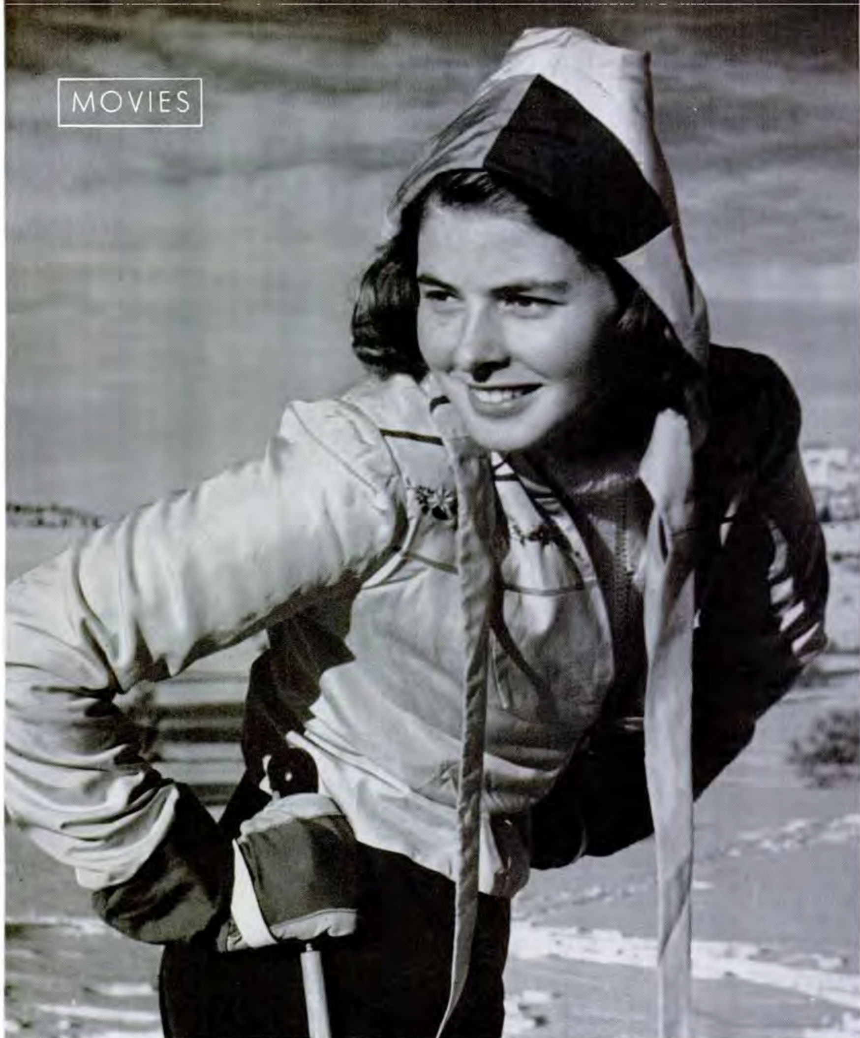
WITH THE WEATHER AT 15° BELOW ZERO, INGRID BERGMAN SKIS 15 MILES AT JUNE LAKE NEAR THE CALIFORNIA-NEVADA BORDER