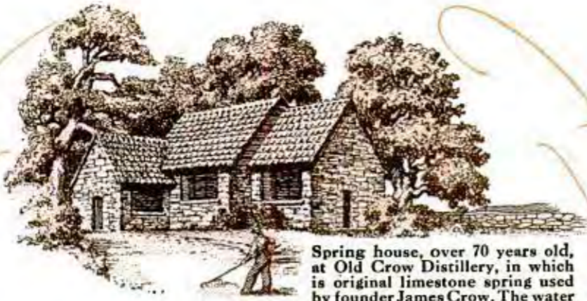
Spring house, over 70 years old, at Old Crow Distillery, in which is original limestone spring used by founder James Crow. The water from this spring is still used exclusively in distilling Old Crow.

Col. Crow's original limestone spring is still used in distilling THIS FAMOUS BRAND